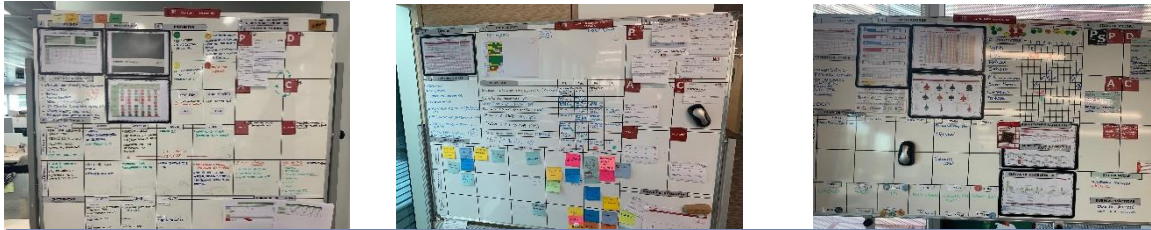
Physical Support for Improvement and Management Routines